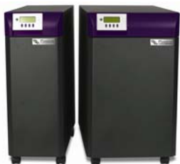
G Entry / G Midrange