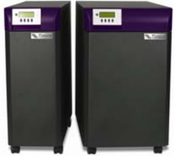
G Entry / G Midrange